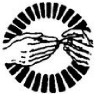
Murray Calloway County Need Line

Save the Date! Our Next Blood Drive Will Be Held On: Thursday, October 18, 2018 From 12:30-5:30 p.m. at FPC