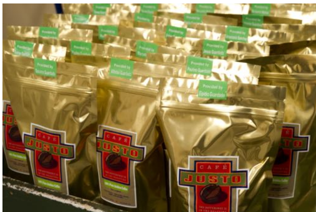
Each package of Café Justo contains the name of the farmer who grew the beans.